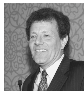
Pulitzer Prize-winning NYT columnist Nicholas Kristof participated in the panel on human rights.