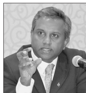
Salil Shetty, secretary-general of Amnesty International, responds to an audience question during the human rights panel.