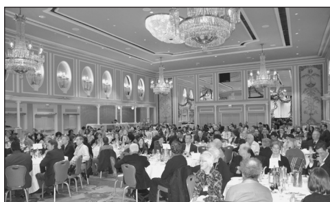
A large crowd attended the 2012 AAG Awards Luncheon in the Hilton's beautiful main ballroom.