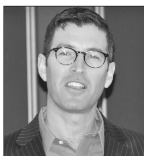
Architect Michael Arad spoke about his design for the National 9/11 Memorial.