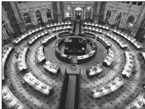
Library of Congress Reading Room.

Several major events at the AAG's annual meeting will help geographers experience and better understand the Library of Congress (LoC), with a special focus on the treasures and scholarly resources of its Geography and Map Division. But as it is the largest library in the world and