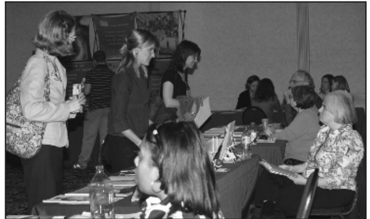
The JIG Center remained busy with many visitors.