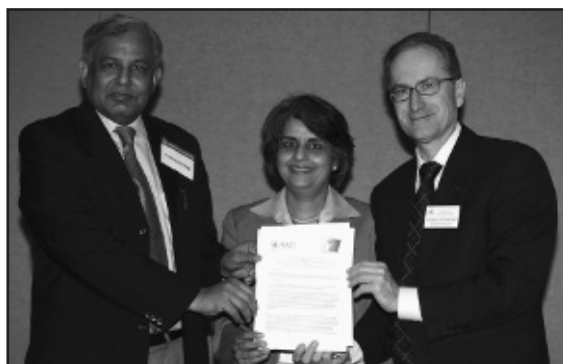
The AAG signed a historic Memorandum of Understanding with the Association of Professional Geographers India, to cooperate on programs and projects of mutual interest in the future.