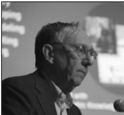
Jack Dangermond, President of ESRI, was the featured speaker at the Brown Bag Plenary, "Geography, GIS, and Africa."