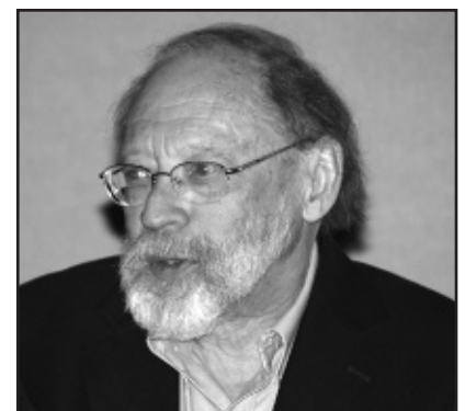
Distinguished biographer and environmental historian Donald Worster discussed the life and work of John Wesley Powell.