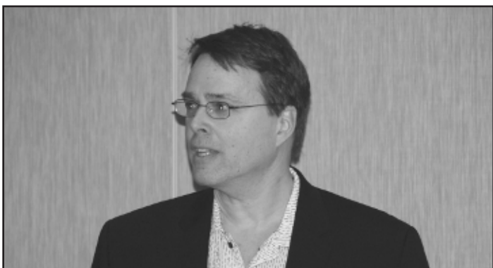
AAG Honorary Geographer Charles Mann discusses his book 1491.