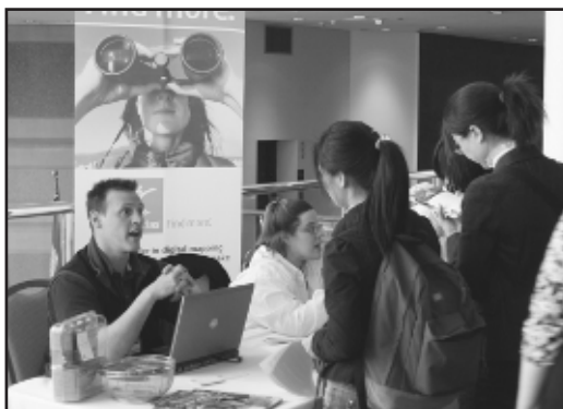
Employers were kept busy at the AAG Jobs in Geography Center.