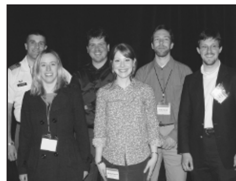
The Middle States team won the World Geography Bowl.