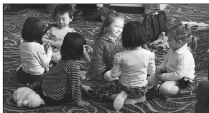
The Annual Meeting provides a friendly atmosphere for families.