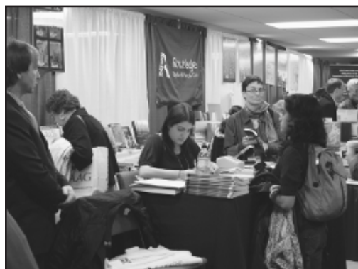
The Exhibition Hall remained busy throughout the meeting.