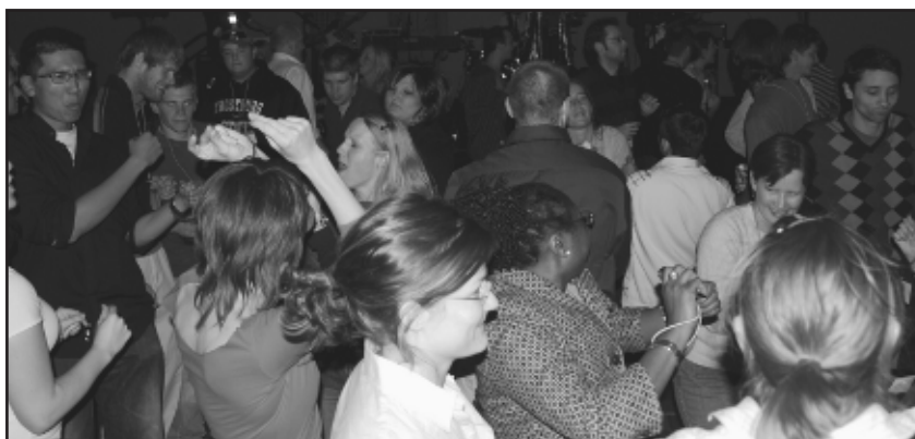
A large crowd enjoyed the music of the Boston band "The Awesome" at the AAG Opening Reception.