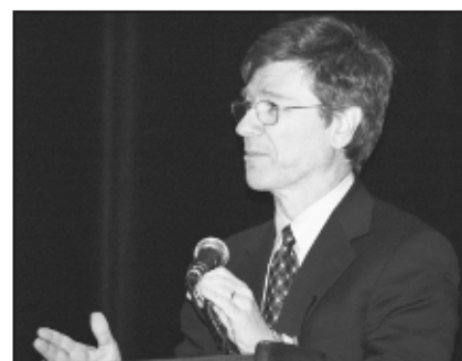
Jeffrey Sachs delivers AAG Keynote Address.