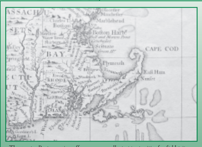
The greater Boston region offers many excellent opportunities for field trips and excursions.

Boston is easily accessible from points around the world through Logan International Airport, where the Massachusetts Bay Transportation Authority (MBTA) blue line connects the airport with Boston's downtown. We look forward to seeing you there.