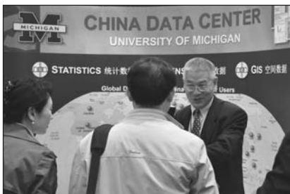
The China Data Center drew large crowds in the popular Exhibit Hall.