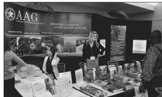
The AAG display booth remained a popular stop for conference-goers throughout the meeting.