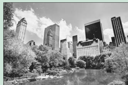
Midtown Manhattan as seen from Central Park.

Abstracts are due by September 28, 2011.