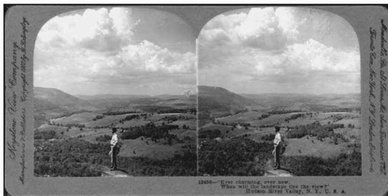
The Hudson River Valley was a popular topic of stereoscopic views during the 19th century.

In 19th-century America, the culture's relationship to nature became central to the meaning of national and self-identity. The country had entered the modern era through the economic forces of capitalism and industrialization. Urbanization was