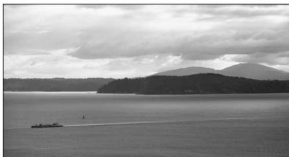
The backdrop of Puget Sound provided a pleasant setting for the conference.