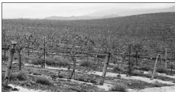
Temecula, shown here in winter, is the center of today's Southern California wine industry.

These new vineyards and wineries, many at the micro-scale, have appeared in widely separated venues, locales where vineyards are never likely to be more than a footnote to nearby suburbs, citrus orchards, nursery greenhouses or chaparral. In the arid reaches of northeastern Los Angeles County, a few vineyards and wineries have found a home in the Antelope Valley, the far western extension of the Mojave Desert. Small wineries