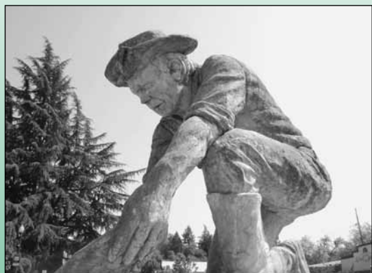
The California Gold Rush of 1849 helped spur the Southern California wine industry. See article at right. Pictured is a 45-ton concrete statue commemorating the discovery of gold in Auburn, California.

AAG Abstract Submission Deadline is October 24.