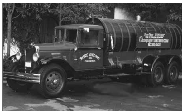
Reminders of Southern California's historic wine industry, such as this delivery truck dating from the 1930s, dot the local landscape.

Temecula's turn toward an emphasis on high quality wine varieties was a first for Southern California. Earlier efforts in the Cucamonga area and elsewhere focused more on varieties such as Palomino, Mission and Carignane for dessert wines (which lead California production until the late 1960s) and jug wines. While Zinfandel grew widely, these were the days before recognition of the variety's capability for superior