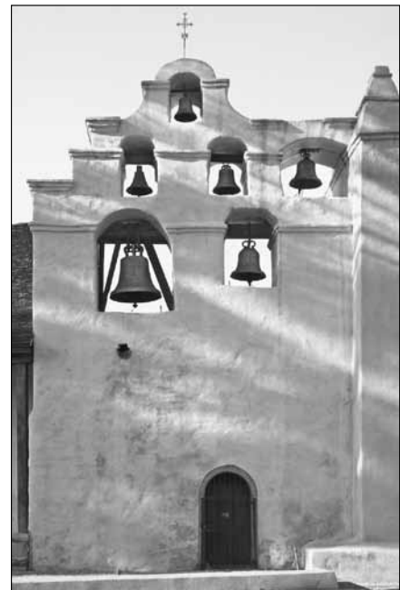
The bells of Mission San Gabriel, one of 21 historic missions in the Los Angeles area.

The AAG Annual Meeting is always an excellent opportunity to renew acquaintances, meet new colleagues, share and discuss ideas, and build enthusiasm and momentum for the progress of the discipline. We look forward to seeing you in Los Angeles.