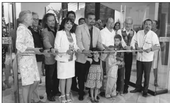
A ribbon-cutting ceremony officially opened the exhibition on the evening of May 4, 2012.