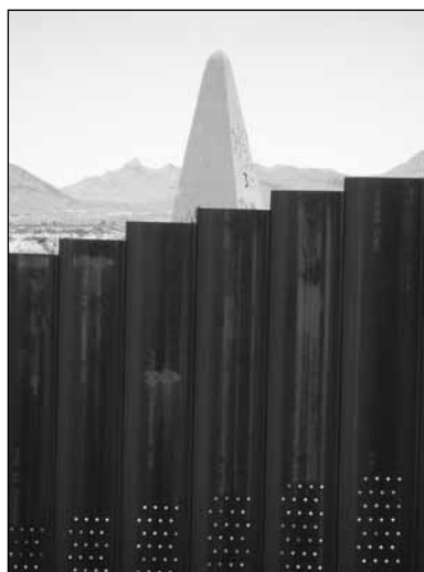
A long-standing boundary marker is obscured by a section of the new wall constructed by the U.S. in the wake of the September 11th attacks.

"Tracing the Line: The Past, Present and Future of Transborder Communities" closes in Mexicali on July 8 before traveling to other locations. For more about the exhibition, including a list of artworks, visit www.savethemonuments.org . ■