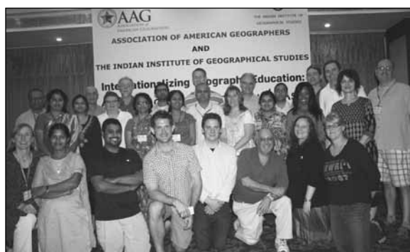
Participants gathered for a group photo on the final day of the workshop.