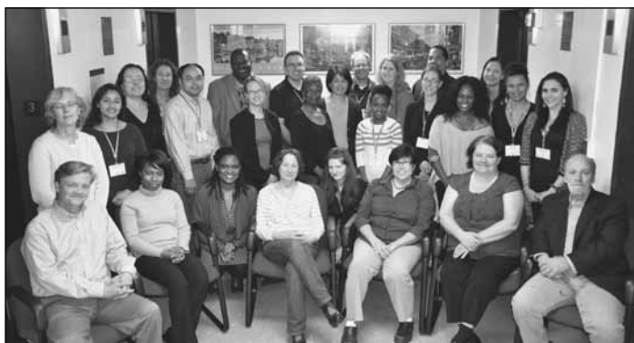
A variety of scholars gathered for the AAG's NSF-funded scholarly retreat "Geographies of Broadening Participation," held at Temple University.

engage in research and writing over the next 10 months and report initial findings at the 2013 AAG Annual Meeting in Los Angeles ( www.aag.org/annualmeeting ). Research teams have applied for and received mini-grants from funds provided for this project by NSF, and will prepare manuscripts for publication that will reflect the potential of geographic perspectives to contribute to a Science of Broadening Participation.