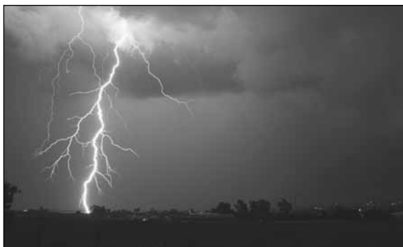
Thunderstorms and lightning play a key role in atmospheric chemistry.

DC3 is the first study to take a larger scale look at both chemistry and thunderstorm details, including air movement, cloud physics and electrical activity at the top of the troposphere.