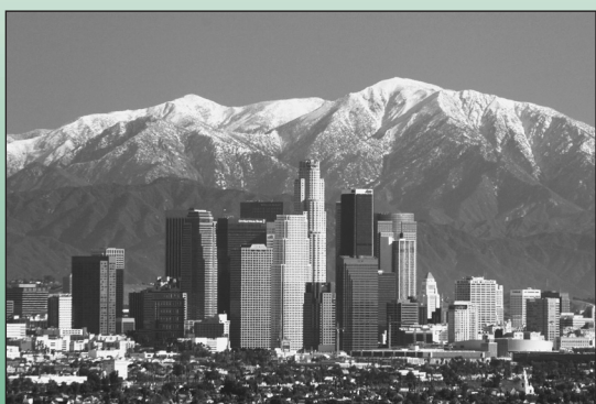
Los Angeles will be the site of the 2013 AAG Annual Meeting, to be held April 9-13. See page 24 for more.