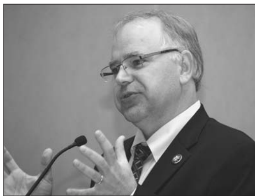
Congressman Tim Walz discussed geography education policy at the Annual Meeting.

Van Hollen is the Chairman of the Democratic Congressional Campaign Committee (DCCC) – an influential House leadership position – so his advocacy for geography education provides a big boost to our cause. He spoke about his childhood as the son of a U.S. Foreign Service officer and asserted that geography is critical to understanding the places and cultures that directly impact our foreign policy and national security. Van Hollen noted that the ESEA reauthorization is a priority for House Democrats in the coming months and that they would be working with Education Secretary Arne Duncan and the Administration to develop strong and effective legislation. He