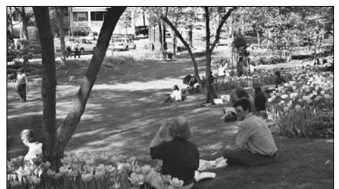
The grounds of the conference hotel provided a pleasant setting to enjoy the beautiful spring-like weather in Washington, D.C.