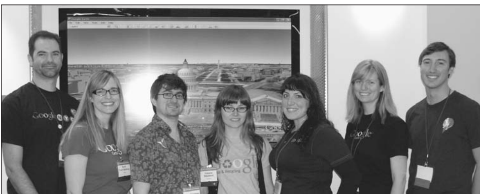
Attendees from Google line up for a group shot in front of their large booth in the Exhibition Hall.