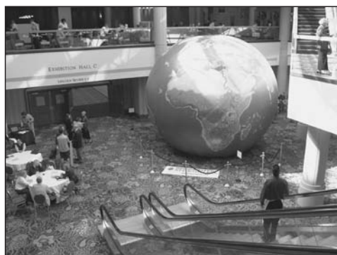
Bridgewater State College displayed a 22-foot tall globe in the atrium of the conference hotel.