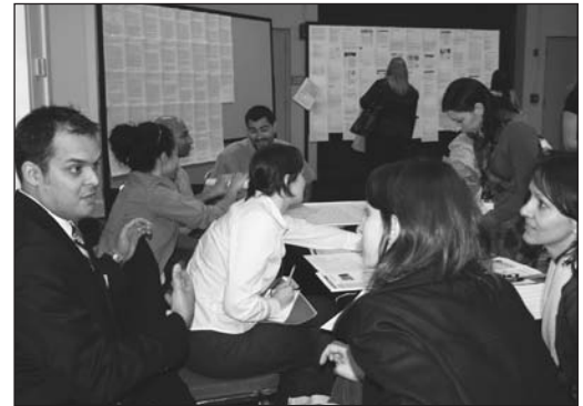
The jobs in geography (JIG) center remained busy throughout the conference.