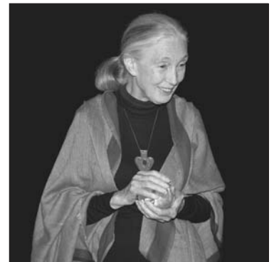
Dr. Jane Goodall holds the crystal globe from the inaugural AAG Atlas Award, which she received on Friday evening.