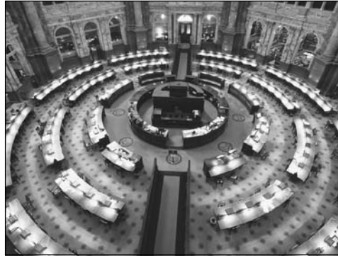
Library of Congress Reading Room.

Several major events at the AAG's annual meeting will help geographers experience and better understand the Library of Congress (LoC), with a special focus on the treasures and scholarly resources of its Geography and Map Division. But as it is the largest library in the world and