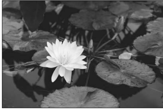
Beautiful Kenilworth Park and Aquatic Gardens, located in Anacostia, is famous for its many varieties of wild water lilies. www.nps.gov/keaq .

Kingman Park residents have scrambled over many years to prevent development ranging