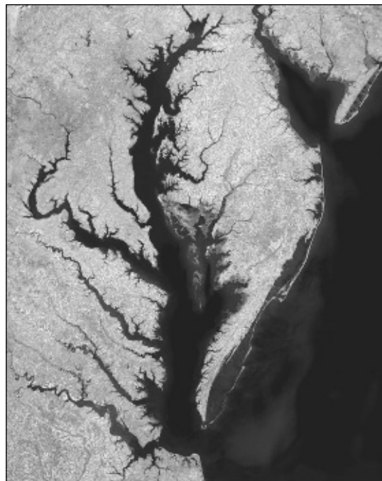
The Chesapeake Bay is the largest estuary in the United States, covering about 64,000 square miles.

Among the more interesting discoveries over the past two decades was that the tip of the Chesapeake Bay, the mouth of the Susquehanna River, contains the largest impact crater in the United States. The bolide