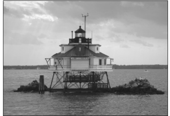
Built in 1875, the Thomas Point Lighthouse has become an icon of the Chesapeake Bay.

Generally, native groups in the upper Coastal Plain at the time of contact were chiefdoms, such as the Powhatans on the James River and the Piscataway on the Potomac River. The various Algonquian-speaking tribes had recently united in the decade before Europeans entered the Chesapeake.