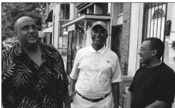
Ethiopian entrepreneurs in the Shaw Neighborhood of Washington D.C. Ethiopian restaurants and small shops are concentrated on 9th and U Streets in NW Washington.

new expensive town homes, post-World War II apartments, and single-family homes. In the 2000 census, 40 percent of the population in the Wheaton-Glenmont CDP was foreign-born and came from over 80 countries. In terms of racial mix, the area went from being over 90 percent white in 1970 to an area that was racially mixed in 2000 (40 percent white, 18 percent black, 26 percent Hispanic and 12 percent Asian). Local officials acknowledge that this transformation has brought certain