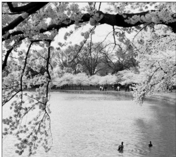
Cherry blossoms around the Tidal Basin in Washington, D.C., signify spring, courage, and international friendship. The National Cherry Blossom Festival® attracts more than one million visitors each year to the nation's capital.

Japanese ornamental cherry trees may be found blooming in many places around the globe, though only in America's capital city is their blossoming as symbolic as it is spectacular. Those of you planning to attend the AAG Annual Meeting may consider spending a few extra days in Washington, D.C. prior to the conference to attend the parade, festival, or other activities, or may simply wish to visit the Tidal Basin. In 2010, the National Cherry Blossom Festival® will open on March 28, with the annual parade and Sakura Matsuri (the largest Japanese-style street festival in the United States) to be held on April 10. The two-week long Festival includes participants from around the world and features cultural performances, exhibits, tours, a parade, and fireworks.