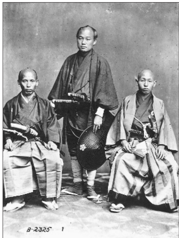
Members of the first official Japanese delegation to the United States in 1860, photographed in Matthew Brady's studio in Washington, D.C.

were transported eastward along the Silk Road, eventually flourishing in the Japanese archipelago. We know that the sight of the cherry trees blooming in Japan has inspired princes, poets, artists and ordinary people for more than 1,000 years. The ornamental cherry trees' blossoms, called sakura in Japanese, have a spiritual meaning for the Japanese people. To them, the sublime beauty of the short-lived flowers—surprising to