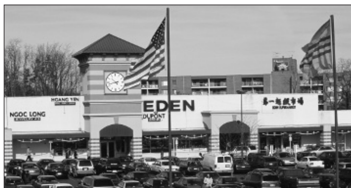
Eden Center, a shopping center in Arlington County, Virginia, is a vibrant commercial and social place for the region's largest Vietnamese community. Note the flag of South Vietnam flying next to the U.S. flag.

In line with national immigration trends, Washington has immigrants from China, Mexico and the Philippines in the top ten. Yet also on that list of top sending countries are less common regions of origination such as Sub-Saharan Africa (Ethiopia, Nigeria, Ghana), Central America (Guatemala and Honduras), the Andes (Peru and Bolivia), the