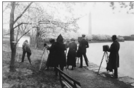
The cherry blossom trees edging the Tidal Basin have inspired artists of all kinds since the trees were first planted in 1912.

Some say cherry blossom trees originated in the Fertile Crescent of the Middle East. Their seeds