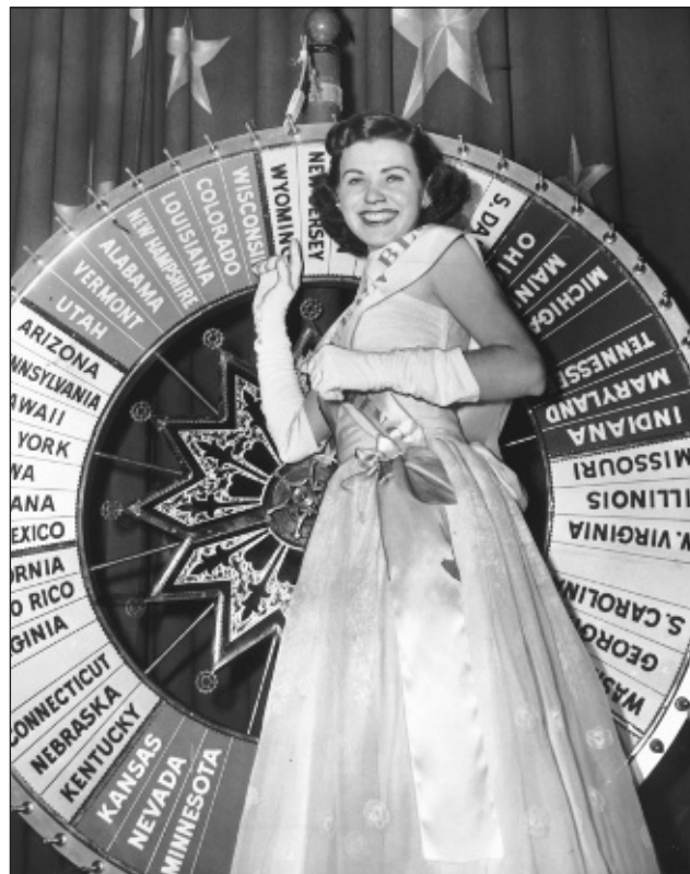
In 1951, the Cherry Blossom Queen hailed from Wyoming after a random spin of the wheel stopped on her home state.

Japanese emperors and their courts established viewing rituals and traditions by the 9th century, C.E. Called hanami , these practices and patterns expanded to include the samurai during the period of their rule under the Shogunate, and were later adopted by common people. The cherry blossom was an important symbol for samurai warriors. Their highly disciplined life as cultured men of war had as a highest goal to die an honorable death, preferably in the line of duty to their overlord and in the prime of life. To