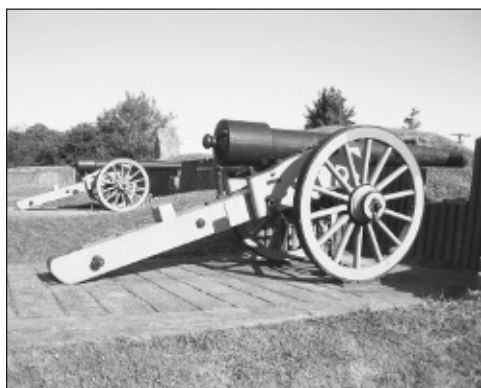
Cannon sit overlooking a quiet residential neighborhood in Washington, D.C., relics of the only Civil War battle to take place in the federal capital.

It would not be surprising if we found that most people's first thoughts of things to see and do in Washington, D.C. involved visits to prominent historical sites such the Washington Monument, the White House, the Lincoln Memorial, and nearby Mount Vernon. However, much like Philadelphia and Boston, the city of Washington and its surrounding region is also home to hundreds of lesser-known sites of historical and geographical significance. Less conspicuous than their more famous cousins, these places are often nestled quietly into the fabric of the everyday life of the city, its neighborhoods and those of surrounding towns.