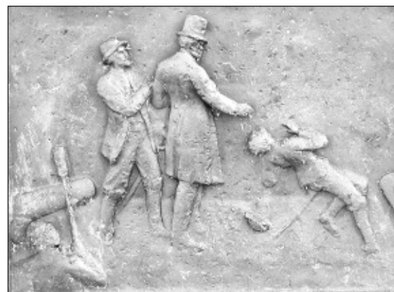
A plaque at the site commemorates the moment a U.S. Army surgeon was shot and wounded while standing next to President Abraham Lincoln during the Battle of Fort Stevens.