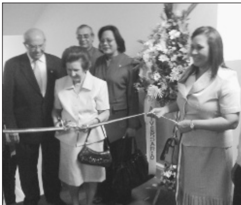
Those present at the ribbon-cutting ceremony are identified in the text, at right.