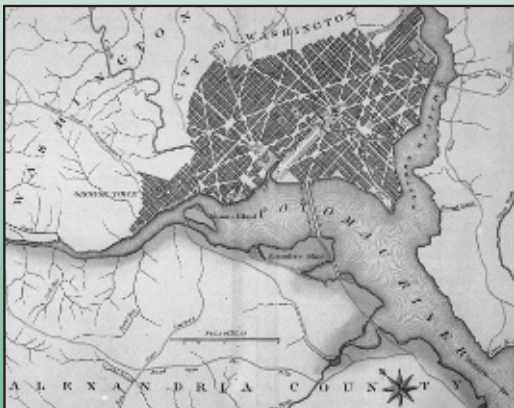
Figure 1: Detail from A Map of the City of Washington in the District of Columbia. Drawn by Robert King in 1818, this view emphasizes the strategic junction of the Potomac and the Anacostia Rivers.