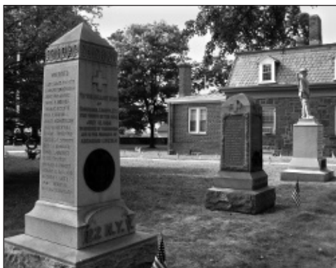
Battleground National Cemetery is just a short walk from Fort Stevens.

One such site is Fort Stevens, the location of Washington, D.C.'s only Civil War battle. Positioned inconspicuously at the corner of 13 th and Quackenbos streets in Northwest Washington, near Silver Spring, the fort is today part of the federal park system and a stop on the African American Heritage Trail. Cannon sit at the earthen ramparts, overlooking a quiet, unassuming neighborhood of simple streets and houses to the north and northwest.