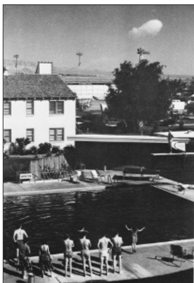
Tourists view a drifting atomic cloud from poolside at the Frontier Hotel on the Las Vegas Strip in the 1950s.

The State of Nevada has lent its voice to a growing chorus that challenges the legality and scientific soundness of these plans. Among opponents' concerns are the long-term (10,000-year) viability of storage containers and, in the relatively