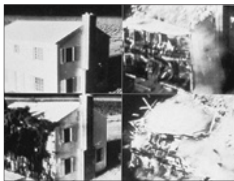
These four frames show the impact of an atomic bomb blast on a test site nicknamed Doomtown in the Nevada desert.