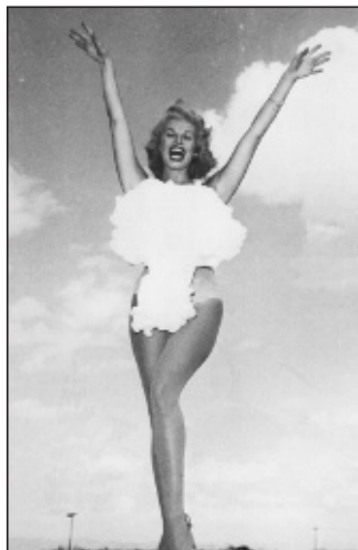
Miss Atomic Bomb (1957) symbolizes the strange love affair between the city of Las Vegas and its former flame.

geography of the technological sublime, and of a particular, and terrifying, set of scientific and technical logics – especially of zealous weapons experimentation, development, and stockpiling. When, in 1961, the Soviet Union unilaterally ended the test moratorium, it took the