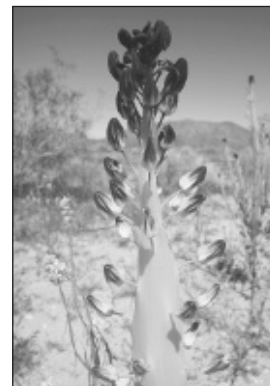
The desert candle is one of many plant species endemic to the Mojave Desert.

The Mojave Desert is home to the greatest diversity of endemic plant species in North America. In good precipitation years (typically sufficient winter precipitation) portions