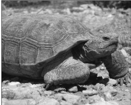
The elusive desert tortoise.

Many of you may know that the Mojave Desert tortoise ( Gopherus agassiz ) is a threatened species...the "spotted owl" of the desert southwest. What you might