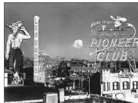
Atomic detonations were visible from downtown Las Vegas in the 1950s and 1960s.

short term, the hazards of transporting radioactive waste to the repository for the next 25 years. Having long since looked elsewhere for entertainment, Nevadans seem far less willing, fifty years on, to underplay or overlook the potential dangers, to themselves and their economy, of an "atomized" landscape. Nevada's nuclear future may be somewhat less spectacular than its past, but it promises to be more long lasting – and in some ways, may have only just begun. ■