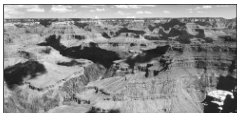
The Grand Canyon.

This three-day trip through Northern Arizona takes you along portions of old Route 66 to the Grand Canyon and on to portions of the Navajo Nation. Day one will include stops at small Arizona towns and a visit to the IMAX theatre in route to the South Rim of the Grand Canyon. Day two includes talks by graduate students who have Park Service and river guide experience. There will be free time at the Canyon before we continue on to historic Cameron Trading Post for the night. Day three we return to Las Vegas after a short side trip onto the Navajo Nation, a visit to Wapatki Ruins and a stop in historic downtown Flagstaff. Elevation change will be over 5,000 feet. Weather is variable. Be