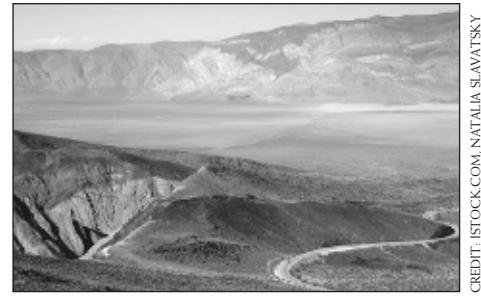
Death Valley will be the site of a day-long field trip.

The field trip will take you from Las Vegas through the Black Mountains of California into Death Valley National Park. We will observe the fossil shorelines of Pleistocene glacial Lake Manly, Badwater – the lowest point in North America – 282 feet below sea level, Devil's Golf Course at the bottom of the valley with its thick salt crust, faults, large alluvial fans, the superb Dantes View,