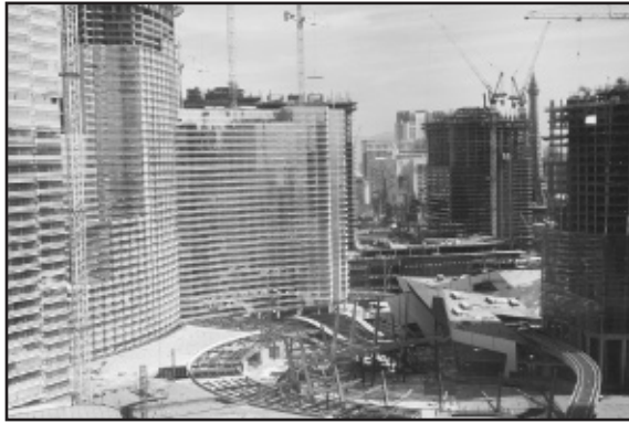
The 66-acre City Center construction site.

From the top of the Paris casino's Eiffel Tower you can see the thousands of hotel rooms along the Strip as well as many of the water features and pools associated with them. You can also see the mass of cranes that are being used to construct more accommodations, condominiums and retail space in the vicinity. The most striking construction project is the new City Center between the Bellagio and the Monte Carlo, which sprawls over 66 acres and will have hundreds of hotel rooms and condos plus retail space and entertainment facilities when completed. The current construction activity around this ultra-modern complex is almost as interesting as any of the casino attractions. It is worth a look from ground level on the Strip, where it occupies about a quarter of a mile of prime frontage. Further in the distance you can see the sprawl of the growing suburbs of greater Las Vegas – including some green splotches representing the over 40 golf courses found in the region. Finally, beyond the ring of remarkable urban and suburban growth you can see the sweeping arid desert of southern Nevada. Therein lies the problem. Las Vegas has over 132,000 hotel rooms and