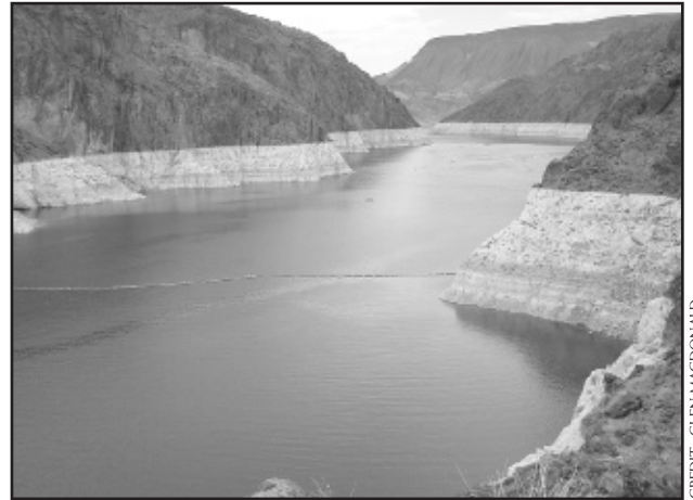
The top of the white band indicates maximum water capacity for Lake Mead. Capacity is currently down to 50 percent.

portrayed in the Academy Award-winning film Chinatown (1972). Similarly, resentment exists among some rural Nevadans and Utahans regarding the new "Las Vegas water grab."