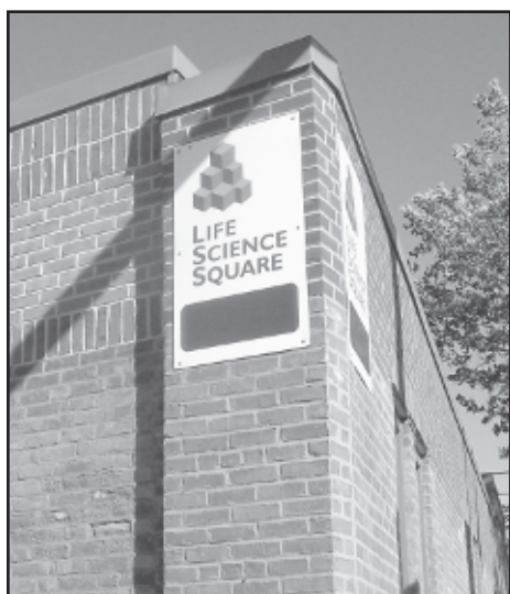
A sign marks a cluster of biotech companies around Life Science Square, Cambridge.

region, from Cambridge (including Life Science Square and other developments) to Worcester. 7 The combined presence of abundant venture capital, a large and growing number of dedicated biotech firms, and an array of public research organizations including its hospitals makes Boston the most organizationally diverse regional cluster in the U.S. biotechnology industry. 8