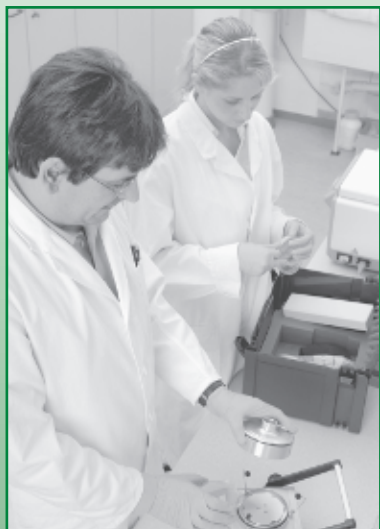
Research and development in biotechnology and medicine helps drive Boston's 21st century economy.