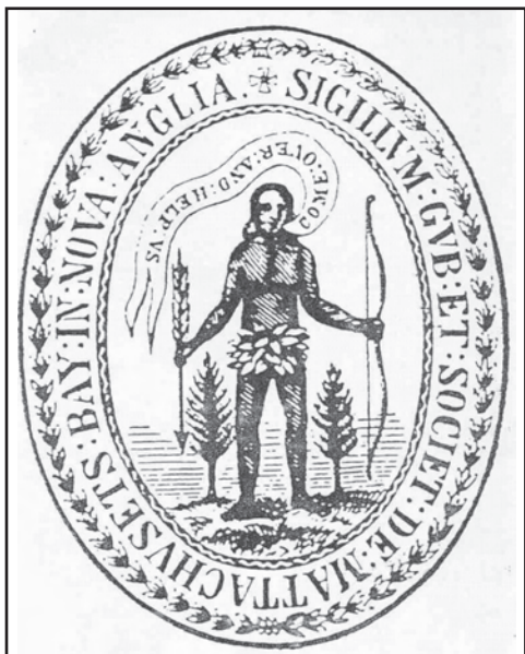
The official seal of the Massachusetts Bay Colony.