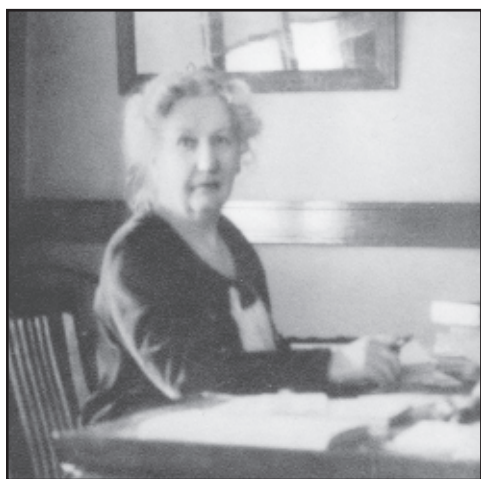
Ellen Churchill Semple

W omen in New England historically have made important contributions to American society. In particular, women in Massachusetts stood out as national leaders in a broad variety of fields. In religion, Anne Hutchinson was an early spiritual leader, Lucy Wright a leader in the Shaker community, and Mary Baker Eddy founded the Christian Science Church. Massachusetts women were