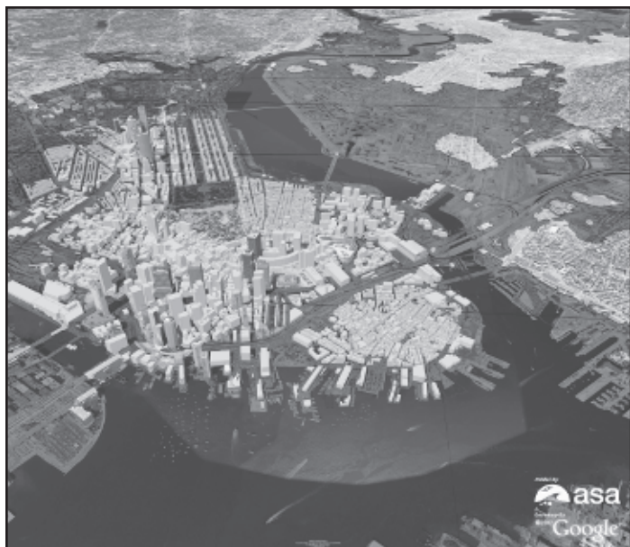
Higher sea levels coupled with 100-year storm conditions could lead to a future flood disaster in Boston, as this computer-generated graphic illustrates.

change on infrastructure systems in the Boston Area conducted at Tufts University, Boston University and the University of Maryland and sponsored by the U.S. Environmental Protection Agency. The CLIMB study (Climate's Impact on Metropolitan Boston) was a collaboration of geographers, engineers and other researchers addressing how increased temperatures, higher sea level, increased frequency of severe weather – all likely outcomes of rising greenhouse gas concentration – will affect the ability of current institutions and infrastructure to provide energy, water, public health and transportation services. While the image of flooding in Downtown Boston captured most of the public attention, the study and its findings were much broader and pointed out important policy issues. (The final report is available at www.tufts.edu/tie/climb .)