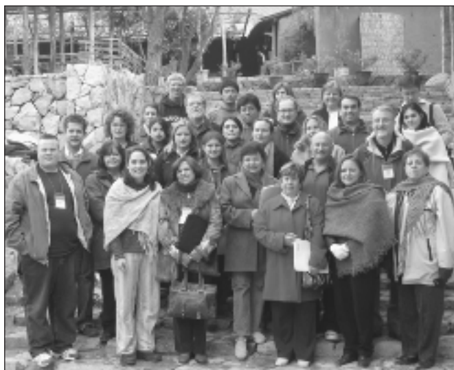
CGGE workshop participants in La Serena, Chile.