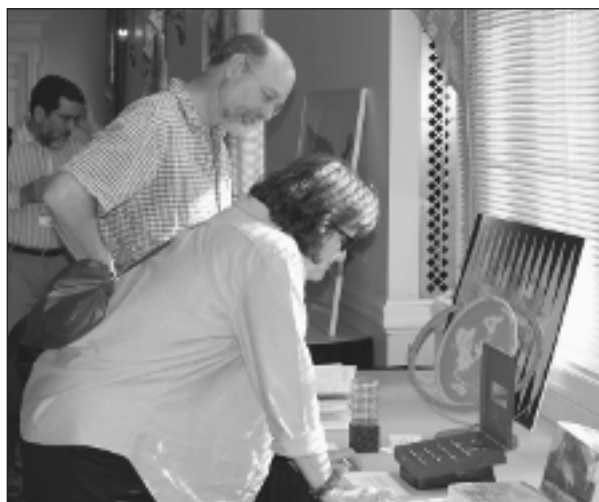
The public was invited to attend the eclectic exhibition of artworks, maps, posters and other visual displays organized for the Symposium.

The Geography and the Humanities Symposium, co-sponsored and organized by the AAG and two partner institutions, brought together geographers, writers, artists, activists, architects, and a variety of humanities scholars from many disciplines in an exploration of recent trends in the increasing interactions between geography and the humanities.