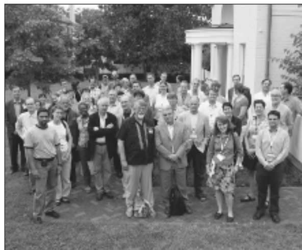
Over 50 scholars, writers, and artists attended the Symposium's concluding roundtable discussion at the Thomas Jefferson Memorial Library.

The Symposium program is available at http://www.aag.org/humanities/index.cfm and may also be found in the June 2007 issue of the AAG Newsletter, pages 8-9. ■