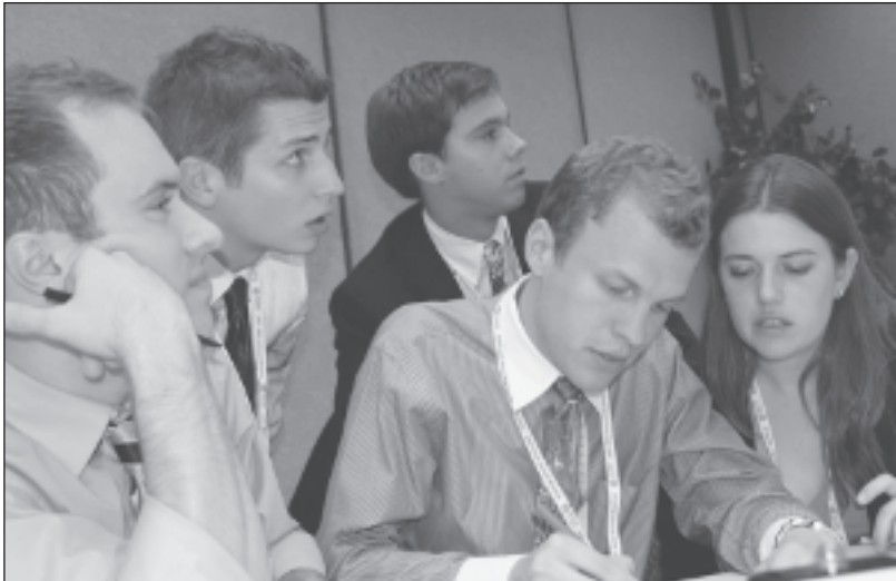
World Geography Bowl team members from the Middle Atlantic Division confer during the tense final round.