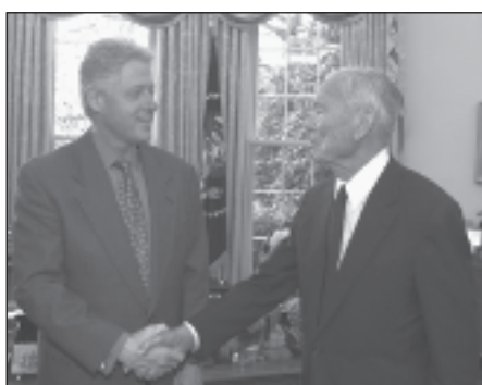
Gilbert F. White received the National Medal of Science from President Clinton in 2000.