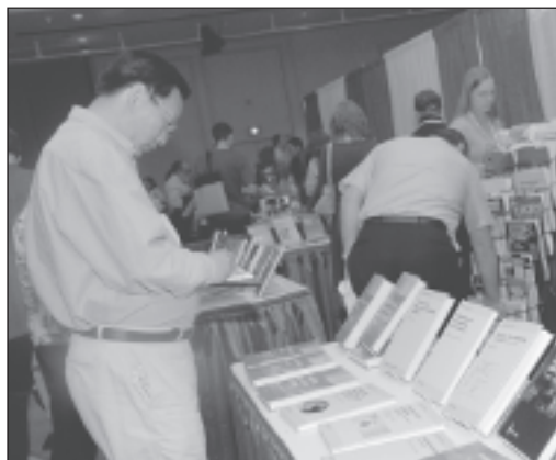
The Exhibit Hall featured 74 booths and a wide variety of organizations.