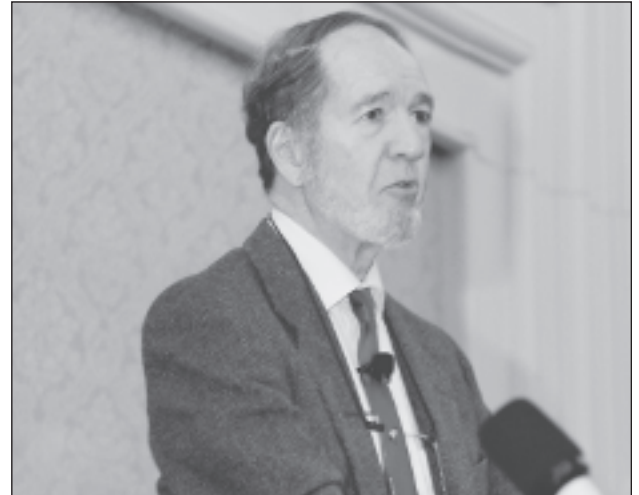
Jared Diamond delivered the opening keynote address at the 2007 AAG Annual Meeting in San Francisco.