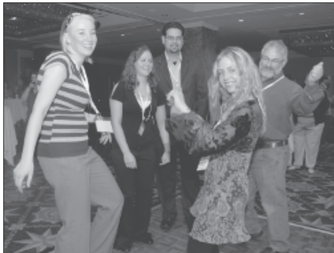
The dance floor was filled at the opening reception.