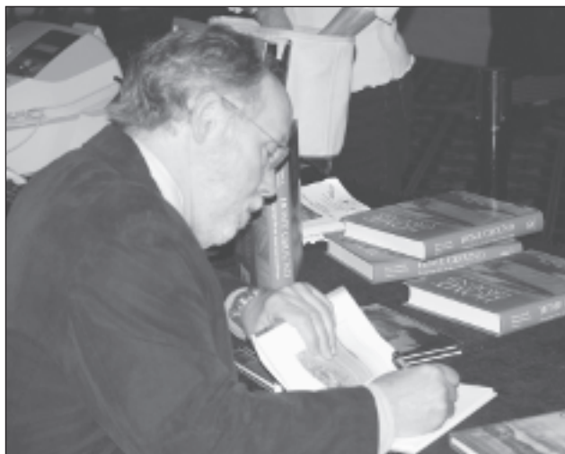
National Book Award winner and plenary speaker Barry Lopez signs copies of Home Ground: Language for an American Landscape.