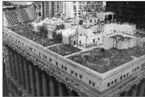
Field trips to the "green roof" atop Chicago's City Hall will be part of the 2006 Chicago meeting.

At least one field trip at the conference will offer the opportunity to investigate the issues facing Calumet by visiting these sites as well as meeting leaders of the various interested groups.