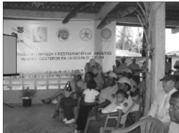
Volunteers in the Costa Arriba meet in Santa Isabel to inaugurate community beach restoration efforts.

community projects. Linkages among the distributed pilot project universities, community organizations, and governmental agencies will include online networking, peer-to-peer mentoring, and a proposed meeting to be held in the region that will showcase project results on sustainability.