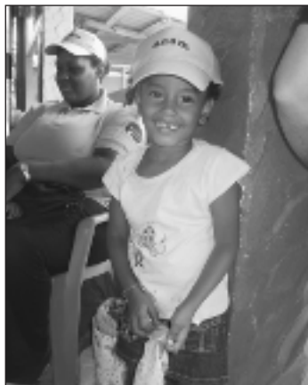
A young volunteer learns about marine and coastal ecosystems thanks to educational materials distributed through the project and her participation in cleanup events.

The goal of the program is to encourage and support undergraduates and their institutions to participate in using geographic tools and concepts for sustainable watershed management within local