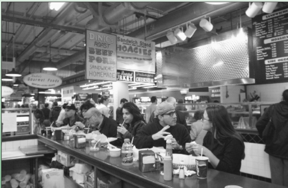
Philadelphia's Reading Market, right next door to the convention, is a good place to sample some of the local ethnic flavors.