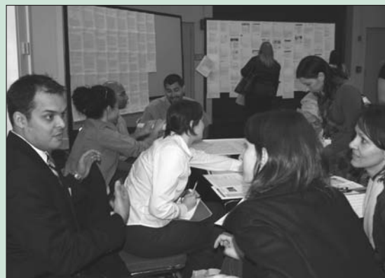
Diversity Ambassadors engaged many visitors at the 2010 Annual Meeting.