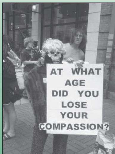
Seattle remains a hotbed of street protest a decade after 1999's "Battle in Seattle."