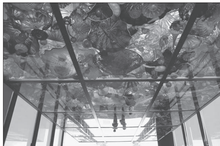
Seattle positions itself as a global city in many ways, including through its arts scene. Dale Chihuly, the world's most famous glass artist, created this "Glass Bridge" in 2002. Seattle promotes itself as the center of the world's art glass community.

are the advocates of global health market foster-care. Their local class allegiance may still be with the boosters of the wealthy