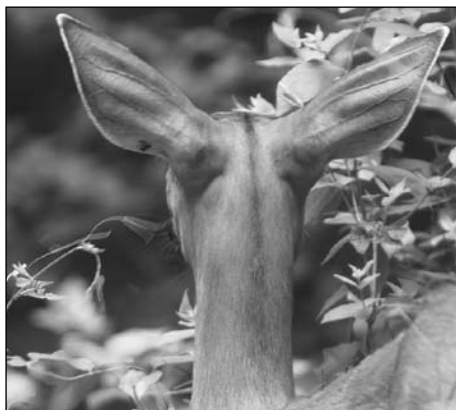
Watch out for those pesky white tail deer in Rock Creek Park – they'll be watching out for you.

For non-urban types among the many geographers expected to attend, Rock Creek Park offers many rustic adventures and attractions. This, at 1,754 acres, is the second largest urban park in the U.S. (geographers should know which is the first) and was set