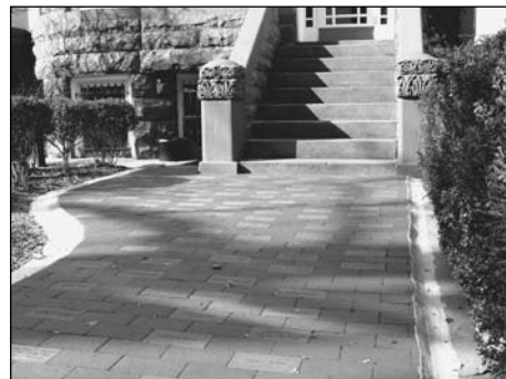
Add your brick to the AAG's commemorative walkway at Meridian Place.

The AAG recognizes and honors the financial contributions of its members in many ways for their continued support of crucially needed AAG programs that help advance our discipline. Both new donors and donors who have previously made contributions in the amount of $1,500 or more are eligible to name a commemorative brick, which will be placed in the new walkway of Meridian Place (AAG headquarters) in Washington, D.C. Proceeds go to the AAG fund of your choice; and all contributions are tax deductible.