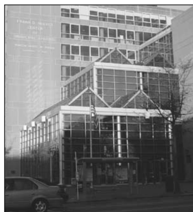
Redevelopment was spurred by the building of the Frank D. Reeves Municipal Center at the intersection of 14th and U Streets in the 1980s.

NOTE: For a good review of the "adult strategy" approach to urban redevelopment see Carol O'Cleireacain and Alice Rivlin's 2001 paper for the Brookings Institution, "Envisioning a Future Washington," available at www.brookings.edu/reports/2001/06cities_ocleireacain.aspx .