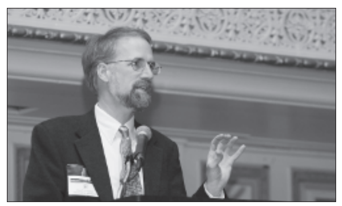
William Cronon delivered the keynote address at the AAG meeting's opening session.