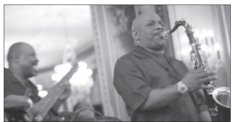
The energetic and gutsy blues of the Big James band got many people dancing.