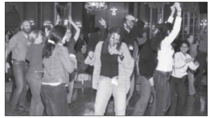
Attendees dance at the AAG welcome celebration