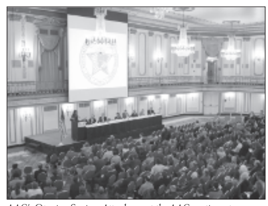
AAG's Opening Session: Attendance at the AAG meeting set a new record with over 5,470 attendees.