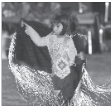
A young participant in the tribal dance demonstration sponsored by the Indigenous Peoples Specialty Group.