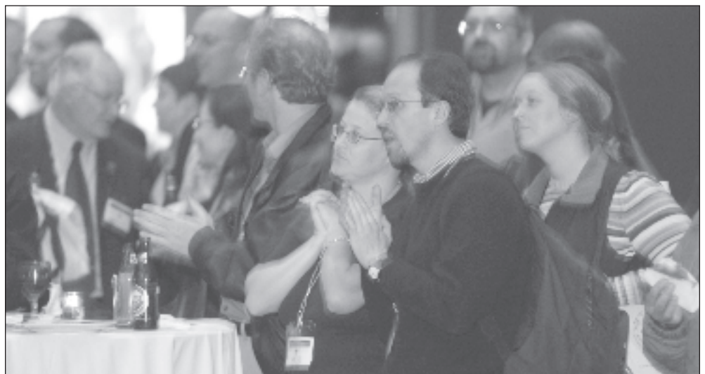
Attendees applauding the tribal dance demonstration sponsored by the IPSG.