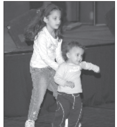
Music at the Western Social Welcome inspired dancers of all ages.