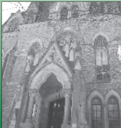
The University of Pennsylvania's College Hall, where the AAG was founded in 1904.

T he University of Pennsylvania has initiated a new Master of Urban Spatial Analytics (MUSA) degree program. It is the first master's degree in spatial analytics offered by an Ivy League institution and is designed for students who wish to apply spatial technologies to business and public sector decision-making. The MUSA degree provides an opportunity to learn about Geographic Information Systems and spatial statistics and to develop a customized program of study from University of Pennsylvania's (U-Penn) rich urban-related course offerings.