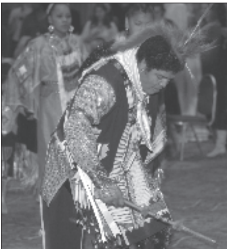
Dancer in the tribal dance demonstration sponsored by the Indigenous Peoples Specialty Group (IPSG).