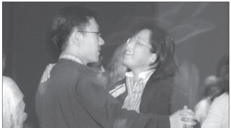
Dancers enjoy live music at the Western Social Welcome.