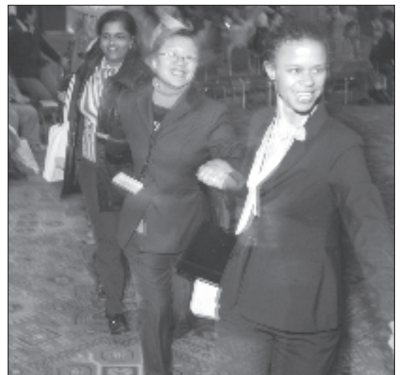
Attendees participating in tribal dance demonstration sponsored by IPSG.