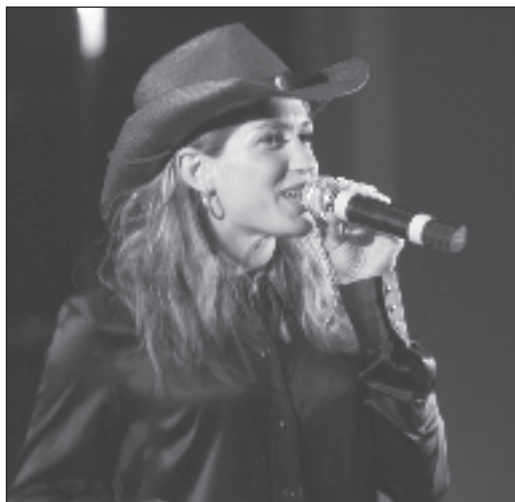
Vocalist from the band Heartbeat entertains crowd at the Western Social Welcome.