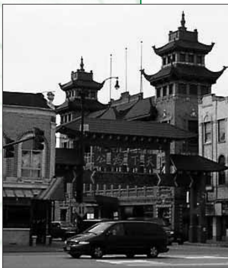
One of Chicago's many ethnic neighborhoods, Chinatown is easily accessible from the AAG's meeting site.

O ver a century-and-a-half ago, Chicago emerged out of the marshy coast of the great inland sea like an ungainly colossus. As the steady waves of humanity pressed upon its shores, the city's population rose in dramatic spurts to become the teeming immigrant metropolis of the mid-continent. Each wave of immigrants has left its distinctive marks on Chicago that has long enjoyed the nickname "City of Neighborhoods." Those who travel to Chicago for the AAG Annual Meeting, March 7-11, 2006, will follow in the footsteps of those immigrants, and will encounter a city that boasts 130