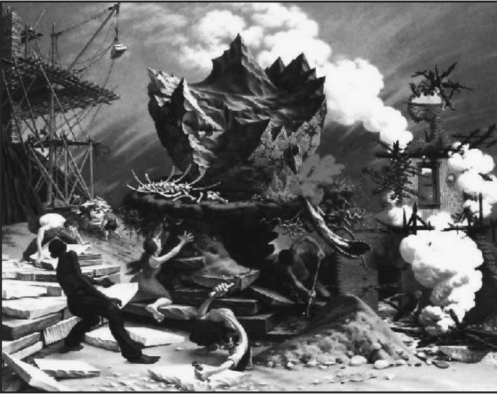
Peter Blume's "The Rock," one of the many powerful works of art on exhibit at the Chicago Art Institute.

One of the great art museums of the world, the Art Institute of Chicago, is located only a few blocks from the headquarters hotel of the 2006 AAG Annual Meeting. The museum's collection spans 5,000 years of artistic expression. Paintings, prints and drawings, sculptures, photographs, video, textiles, and architectural drawings and fragments are complemented by a year-round schedule of exhibitions.