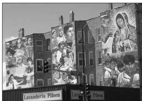
A mural in Chicago's Latino neighborhood of Pilsen.