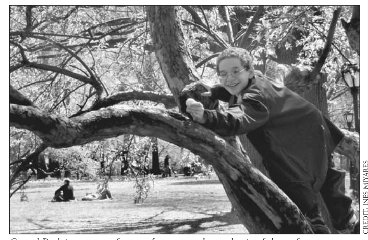
Central Park is a must see for out-of towners and near the site of the conference.

Running from 60th Street to 110th Street, a short subway ride or 10-15 minute