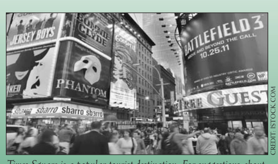
Times Square is a popular tourist destination. For suggestions about things to do with family while at the AAG Annual Meeting in New York, see article at right.

ew York City has experienced a complete transformation over the past two decades, particularly in areas near the Hilton in Mid-