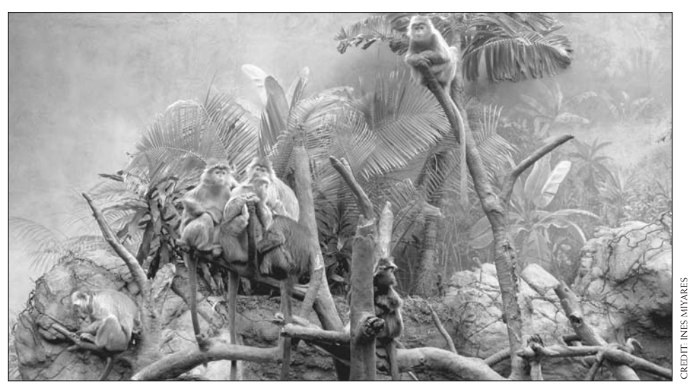
The Bronx Zoo is known as one of the world's best.

ibility due to snow or fog. Many of the city's open-air tour bus companies are also located along 34th Street.