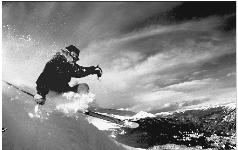
Several Rocky Mountain ski packages are available at low cost to AAG Annual Meeting attendees.

Trips to Winter Park Resort , the oldest continually operated ski resort in the Colorado Rockies, are also planned. Winter Park receives the most snow of all Colorado destination resorts and is a haven for family skiing with beautifully-groomed cruiser runs, terrain parks, halfpipe, and a host of popular learn-to-ski programs. With over 100 designated trails, something can be found for everyone.