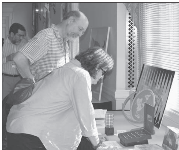
The public was invited to attend the eclectic exhibition of artworks, maps, posters and other visual displays organized for the Symposium.

The Geography and the Humanities Symposium, co-sponsored and organized by the AAG and two partner institutions, brought together geographers, writers, artists, activists, architects, and a variety of humanities scholars from many disciplines in an exploration of recent trends in the increasing interactions between geography and the humanities.