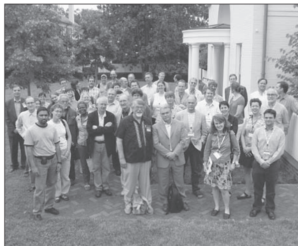
Over 50 scholars, writers, and artists attended the Symposium's concluding roundtable discussion at the Thomas Jefferson Memorial Library.

The Symposium program is available at http://www.aag.org/humanities/index.cfm and may also be found in the June 2007 issue of the AAG Newsletter, pages 8-9. ■