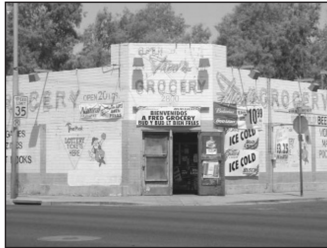
Figure 3. Immigrant businesses are changing the cultural and commercial landscape of central Phoenix.

tions to be dominated by older white Anglo voters even where the school-aged population is heavily Hispanic. These disparities are exacerbated by substantial differences of the age structure of Hispanics and white Anglos. The median age of non-Hispanic whites in metro Phoenix is 35.5 years,