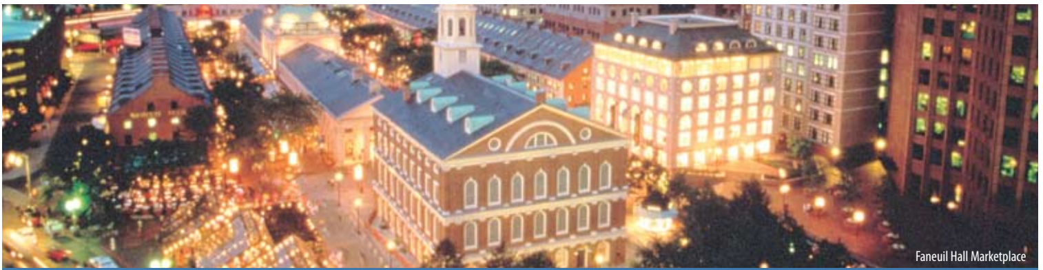
Faneuil Hall Marketplace